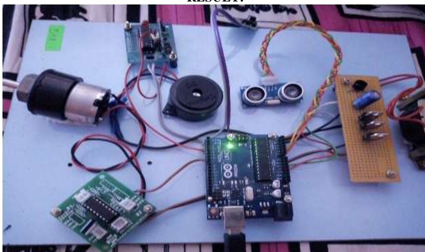
Fig1: hardware implementation